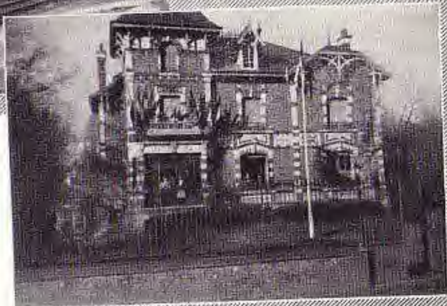
DREUX — FRANCE